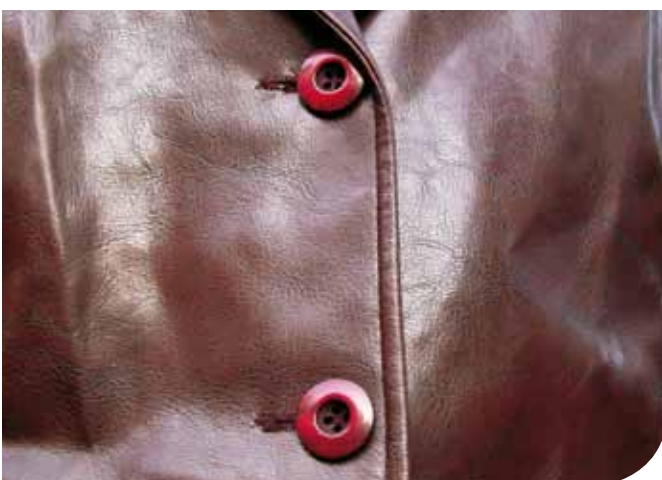
Close to the reality - artificial leather